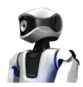
Robomax A Robotics & Al Research Lab