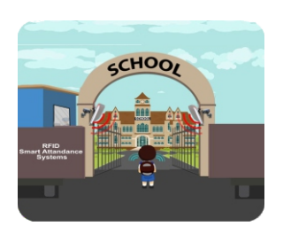
UHF/Biometric Based Attendance System